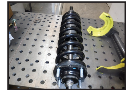
10. Mark the upper mount of the shock assembly in line with the rod end of the shock. This will be referenced when putting it back together. [FIGURE 10]