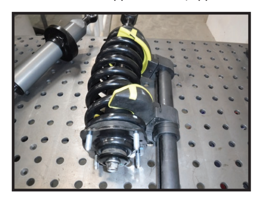
11. Use a sturdy coil spring compressor to compress the coil spring of the factory coilover assembly. Once the coil is free from it's seats, remove the shaft nut and upper coil seat/upper mount. [FIGURE 11 & 12]